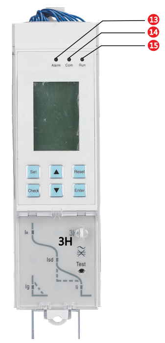
C Type Release / OCR